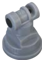
TT TURBO TEEJET®