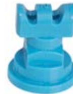
TTJ60 TURBO TWINJET®