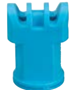
AITTJ60 AIR INDUCTION TURBO TWINJET®