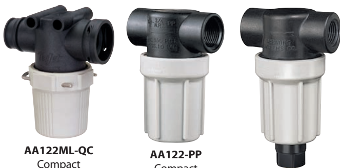
AA122ML-QC Compact Liquid Strainer