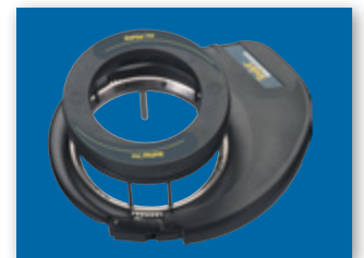
ELECTRIC STEERING DEVICE

Learn more about UniPilot Pro and Matrix Guidance, visit www.teejet.com