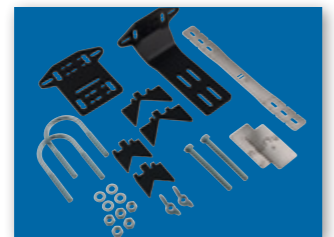
UNIVERSAL MOUNTING KIT