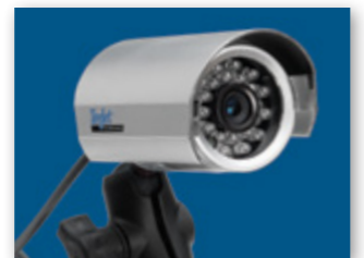
ACCOMMODATES UP TO EIGHT CAMERAS