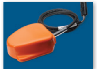
FOOT SWITCH INCLUDED